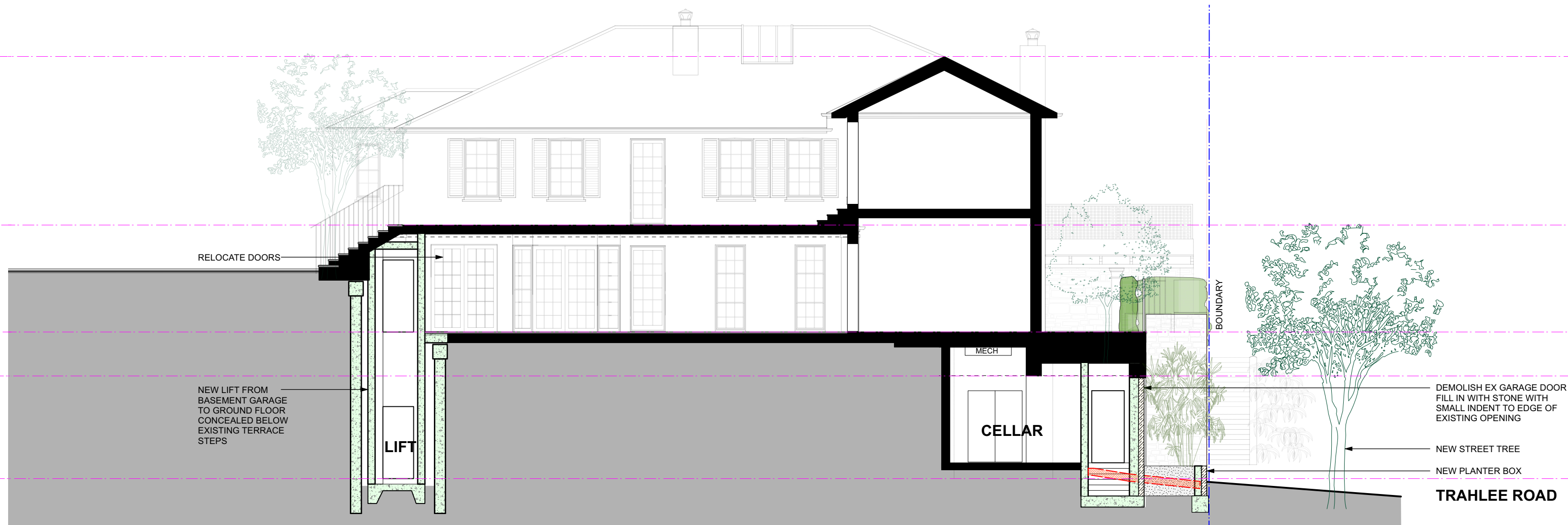
2 Section B Scale 1:100